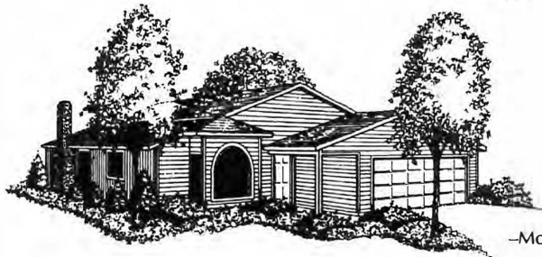
-Model Elevation B

All artist's conceptions of exterior elevations may include optional features.