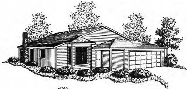
-Model Elevation C