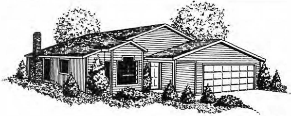
-Model Elevation A