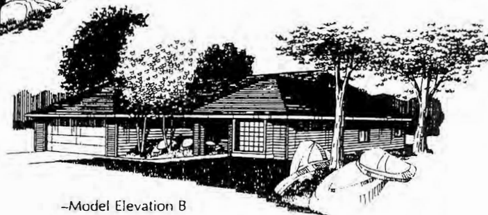
-Model Elevation B

All artist's conceptions of exterior elevations may include optional features.