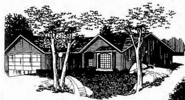
-Model Elevation A