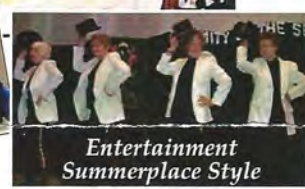
Entertainment Summerplace Style

The condominiums share the pride of ownership prevalent throughout Summerplace: