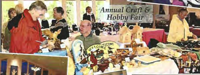
Annual Craft & Hobby Fair