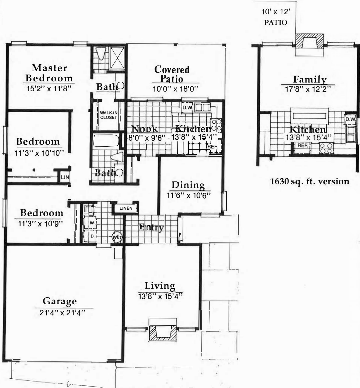
1450 sq. ft. version

In our effort to constantly update and improve our designs, we reserve the right to modify or change plans, specifications, features, and prices without prior notice. Room sizes are approximate.